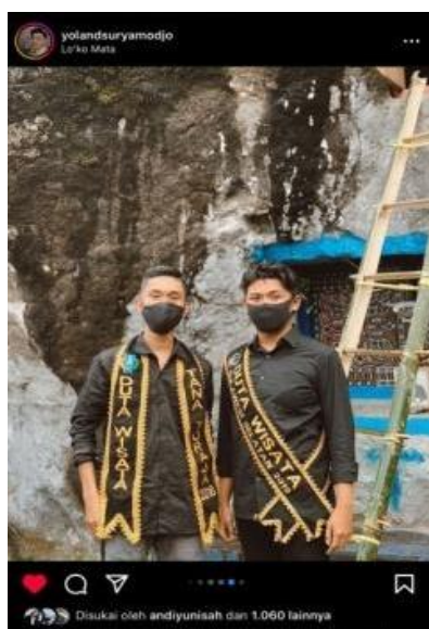
Picture 1 & 2 photo posts of tourism ambassadors of Tana Toraja regency in promoting tourist attractions and traditional ceremonies

The power of Instagram in conveying information and attracting the attention of tourists is very influential, as seen from the uploading photos of tourism ambassadors who are promoters promoting tourism and culture in tana toraja. The tourist ambassador attended one of the attractions, namely loko' mata, which is the venue for the ma'nene traditional ceremony. Loko' mata is one of the cultural and historical attractions that has a lot of history. Loko' mata is a traditional toraja cemetery in the form of a large stone with manually hewn burrows and is used to bury deceased families. The higher the burrow, the higher the social status of the family in society.