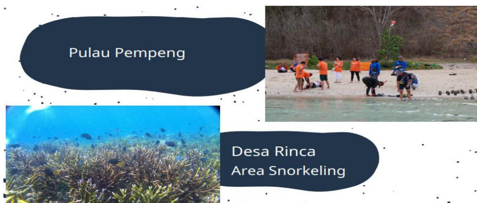
Figure 2. Tourist Destinations

The economic and social development of tourism in a tourist destination also requires the key to success and active participation of the local village community, the village government, and the central government in the development of Rinca Island tourism from an economic and social perspective, namely by identifying opportunities and turning them into income while maintaining local wisdom. Therefore, it is necessary to improve sustainable tourism management, as well as improve the human resources of the local community. In addition, by preserving the environment, culture, and customs, it will be the spearhead for Rinca Island tourism and bring about economic and social changes. Also, being able to speak English can directly help good communication between the local community and tourists. Therefore, good cooperation is needed from all parties in this case the village government, community organizations, tourism actors, and the general public is the key to success in developing tourism from an economic and social perspective.