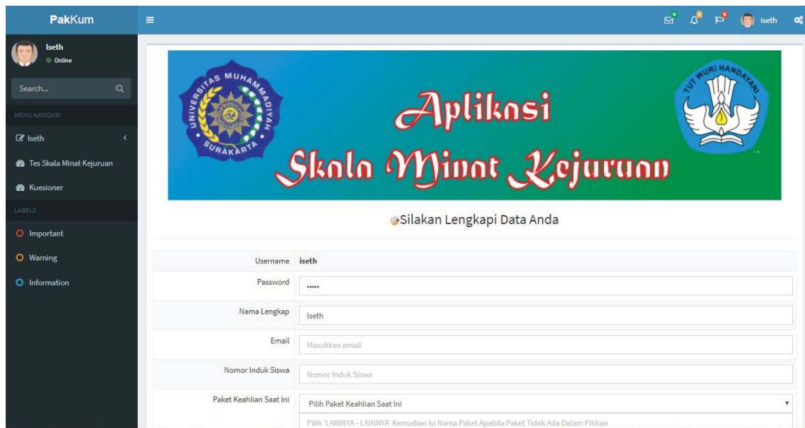
Figure 2. Initial Application Layout.

The interest patterns measurement application can be accessed at http://psikometriums.com page by selecting the “Skala Minat ( Interest Scale )” menu. The initial layout of the app for users after login is depicted below: