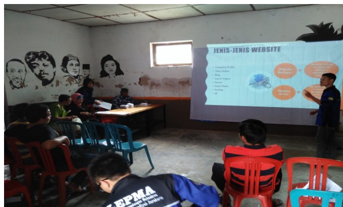
Fig. 2. Implementation of online marketing training.

Marketing is basically the process of communicating and exchanging offers on the values of product or service to customers, partners, and the public in general. The process can be done directly and indirectly. The direct marketing is performed by communicating/advertising the offer to customers or the public through face-to-face method. Meanwhile, indirect marketing is done by using media, e.g. online media. Essentially, online marketing has wide market coverage in compared to direct marketing (face-to-face) since it is able to reach people from diverse countries to find out the offered products or services without having to meet in person. Moreover, the methods of online marketing vary, including through social media account ( instagram , facebook , and others), website, and online shop. It can be an alternative choice of indirect marketing media that can be used by business actors. In addition, the use of the Internet should be based on the principle of up-to-date. Thus, customers and the public in general can update the information of products or services clearly and easily.