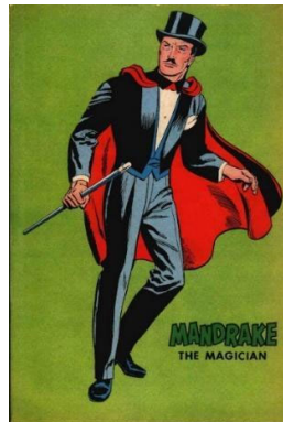
Figure 2. Mandrake The Magician character (Matthew, 2015)