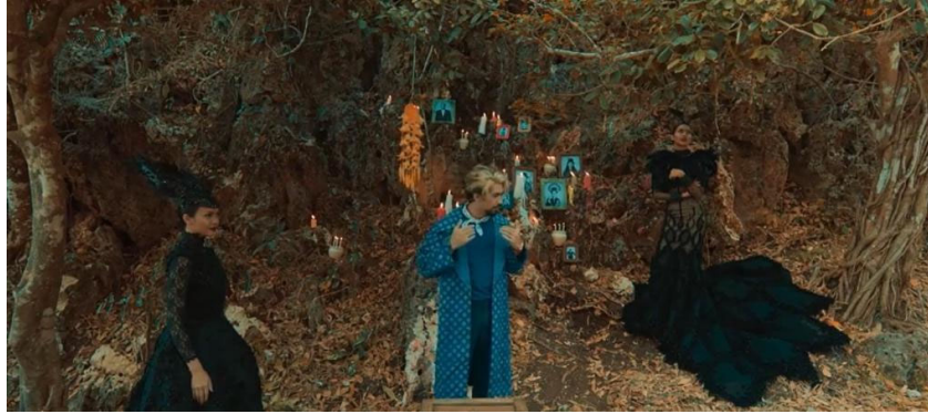
Figure 7. Twin Astrologer Makeup and Costumes (IMDb, 2019)

up of rouge, lipstick, and eyebrows in general. Combined with the 60s-era bun makeup. The choice of classy and luxurious materials is a way to realize the fantasy in this movie.