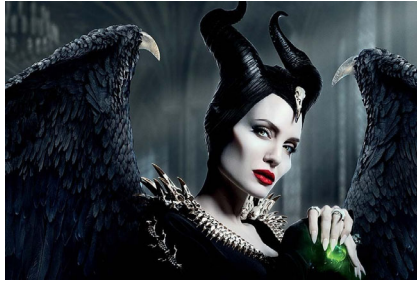
Figure 4. Maleficent character (Astuti, 2019)