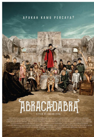
Figure 1. Poster Film Abracadabra (IMDb, 2019)

The actors had to wear costumes of different colors in different settings to achieve a similar look. This means that the characters in Abracadabra wear unusual clothes, or clothes with unique designs, bright colors, and styles that are different from everyday clothes. In addition, some of them had to use bold and colorful makeup such as eyeshadow with striking colors or striking lipstick. To ensure that their skin looks natural in post-production (Damar, 2020). This movie is interesting to explore because every character in Abracadabra has an eccentric look with extravaganza costumes and make-up. The term extravaganza can also refer to elaborate and spectacular theatrical productions (Kalani, 2021). It becomes part of the aesthetic or style of the movie that creates a fantastic world or out-of-this-world. These striking character appearances can also be used to communicate important story elements or themes in the movie.