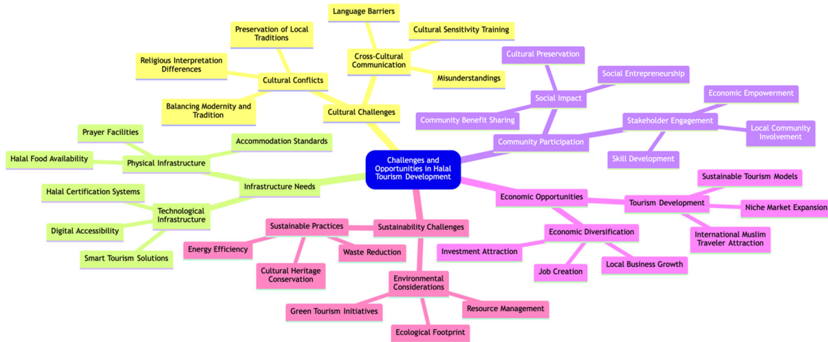
Figure 3. Challenges and Opportunities in Halal Tourism Development

The mind map illustrating "Challenges and Opportunities in Halal Tourism Development" provides a strategic visual framework that complements the textual analysis of challenges facing the halal tourism sector. As discussed above, the halal tourism landscape is complex, requiring a nuanced approach to addressing potential obstacles while leveraging emerging opportunities as shown in Figure 3 .