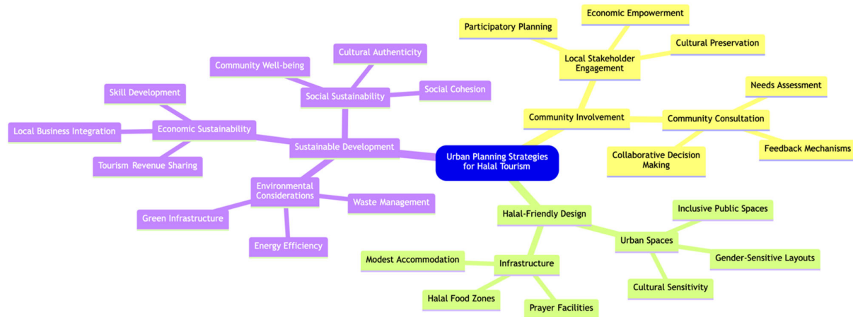
Figure 2. Urban Planning Strategies for Halal Tourism

The mind map in Figure 2 serves as a visual representation of these interconnected strategies, highlighting the importance of community involvement, halal-friendly design, and sustainable development in the context of halal tourism. It illustrates how effective urban planning can harmonize traditional Islamic values with modern innovations, ensuring that tourism offerings not only meet religious standards but also enhance the overall visitor experience (Isnaeni et al., 2024; Kamal et al., 2023) as shown in Figure 2.