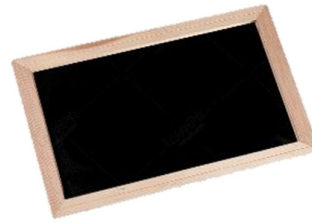
Figure 2. Modern Lauhah

Here are the steps to write the Qur'an on a wooden board: