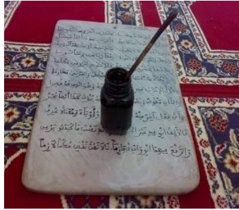
Figure 1. Lauhah middle eastern style (classic)