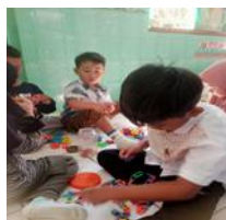
Figure 3. Colorful chain meronce activity

Here the child is still difficult to control social-emotional in playing blocks, children still like to fight and fight for blocks, if the block is taken by their friend, there is a response of the child who cries and it is difficult to express his emotional feelings. There are benefits contained in playing blocks, such as: Children can learn to negotiate, cooperate, and share with peers, Children can feel that there are others with similar thoughts and are invited to share, Children can learn to rely on themselves and improve focus, Children can show attention when friends fail to arrange blocks, and Children can appreciate the work of friends