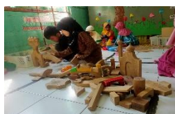
Figure 2. Playing with blocks